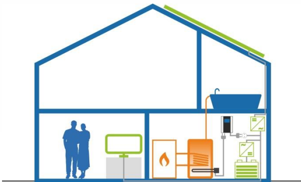
Figure 2: AC•THOR in an AC off-grid

AC•THOR is plugged into an AC socket like any other load. No additional communication wiring is required.